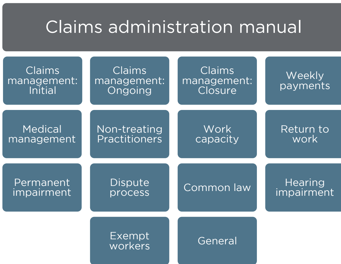
Figure 3: Proposed CAM format

Each of the sections will encompass a range of topics to provide a comprehensive framework of claims management guidance material. In addition to providing guidance and direction, the CAM may also provide links to information, relevant research and resources that are known to promote claims management behaviour leading to positive outcomes.